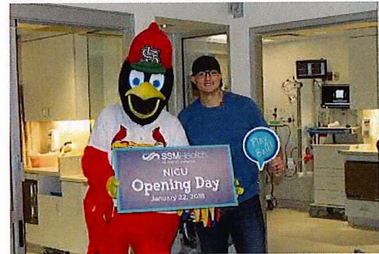
St. Louis Cardinals relief pitcher Brett Cecil and Fredbird visited with families.