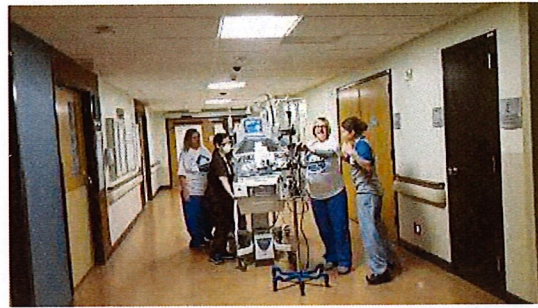
The 31st and final baby to make the move to the new NICU!