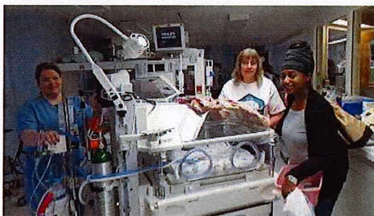
Ready to go!