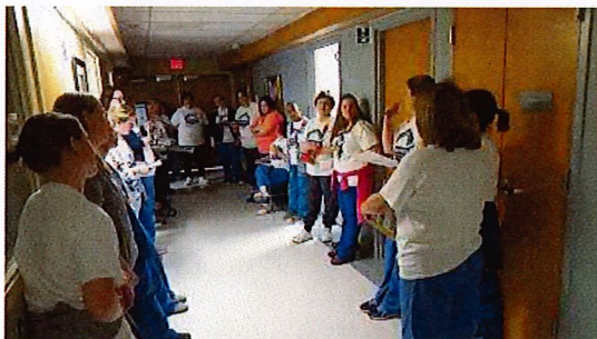
Last huddle in the old NICU

Watch this video to learn more about all of the special features in the new NICU.